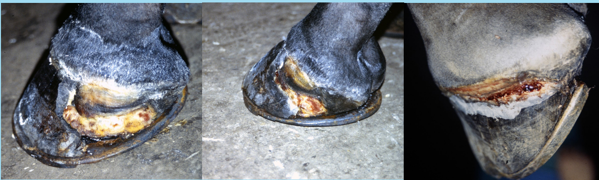
Hoof capsule avulsion