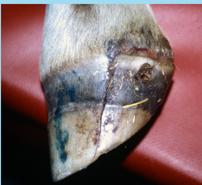
Coronary band lacerations